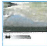
52" Samsung LCD 1080p HDTV SamsClub.com