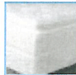
Serta Grandis Low Profile Mattress ... SamsClub.com