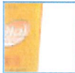
Liquid Dial® Gold Antimicrobial So... SamsClub.com